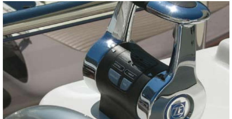
SmartCommand Control Head