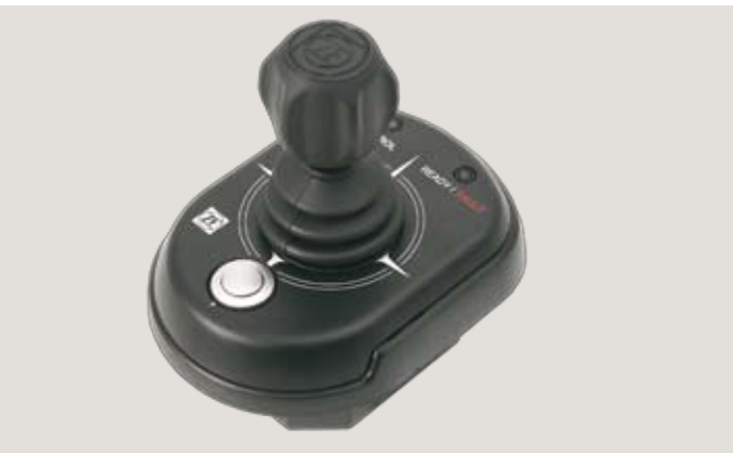
Joystick Maneuvering System

This Pod Drive System is a compact and light unit, best suited for the most popular sized pleasure crafts.