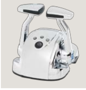
MC2000 Control Head