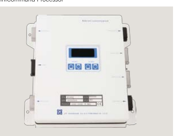
MI2002 MiniCommand Processor